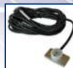
Panel temperature probe