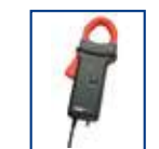
PAC current clamp