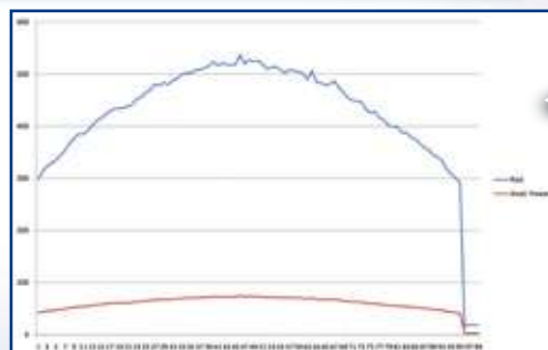
Example of a power-insolation curve

Firmware updates are also applied via this software.