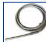
Ambient temperature probe